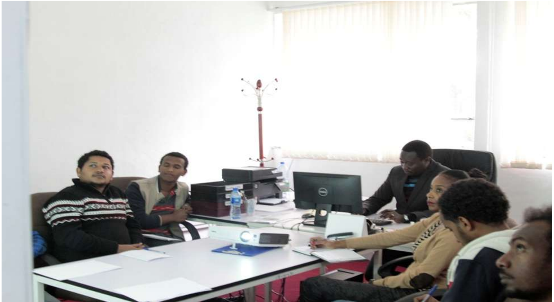
Discussion on teaming up with ICT to improve website content