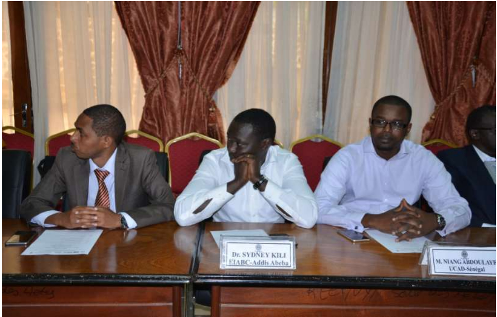
Partners selection meeting, four EiABC staff were selected for exchange