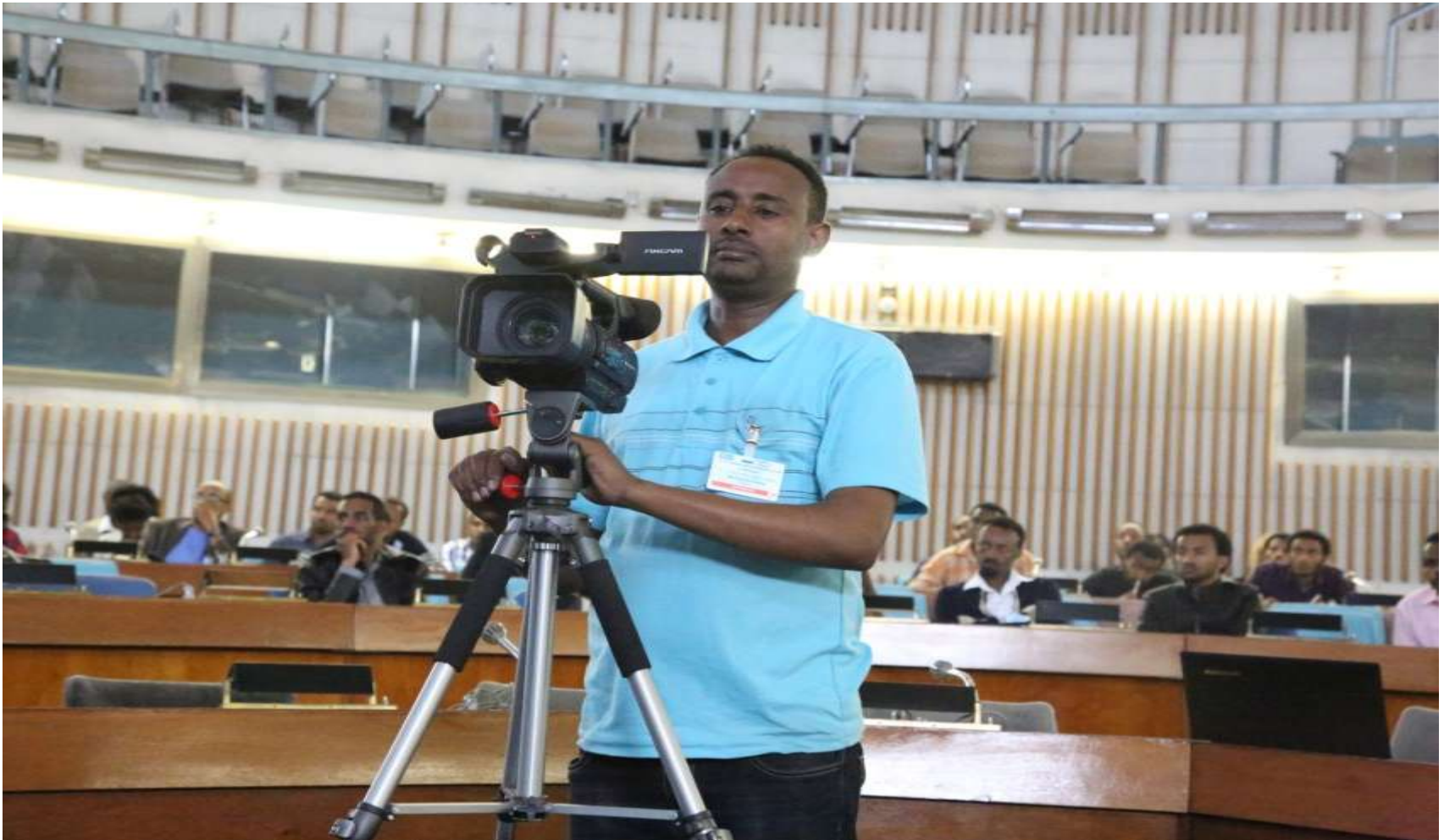
IRCO staff professionally covering the event at United Nations Commission for Africa