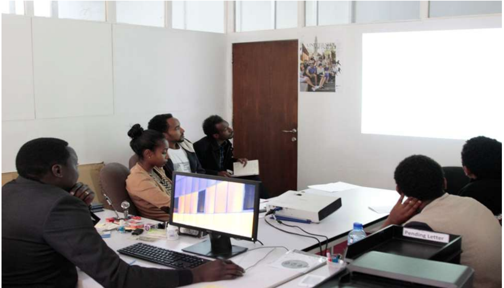
Meeting with ICT team including Web admin to see way to improve EiABC website