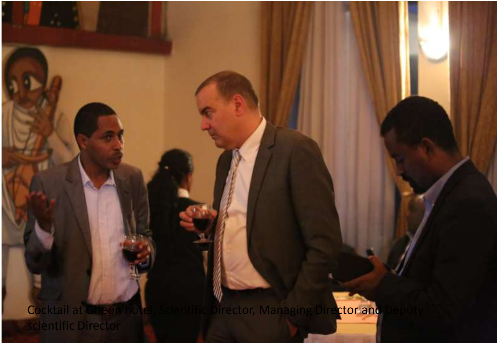
Cocktail at Gheon hotel, Scientific Director, Managing Director and Deputy scientific Director