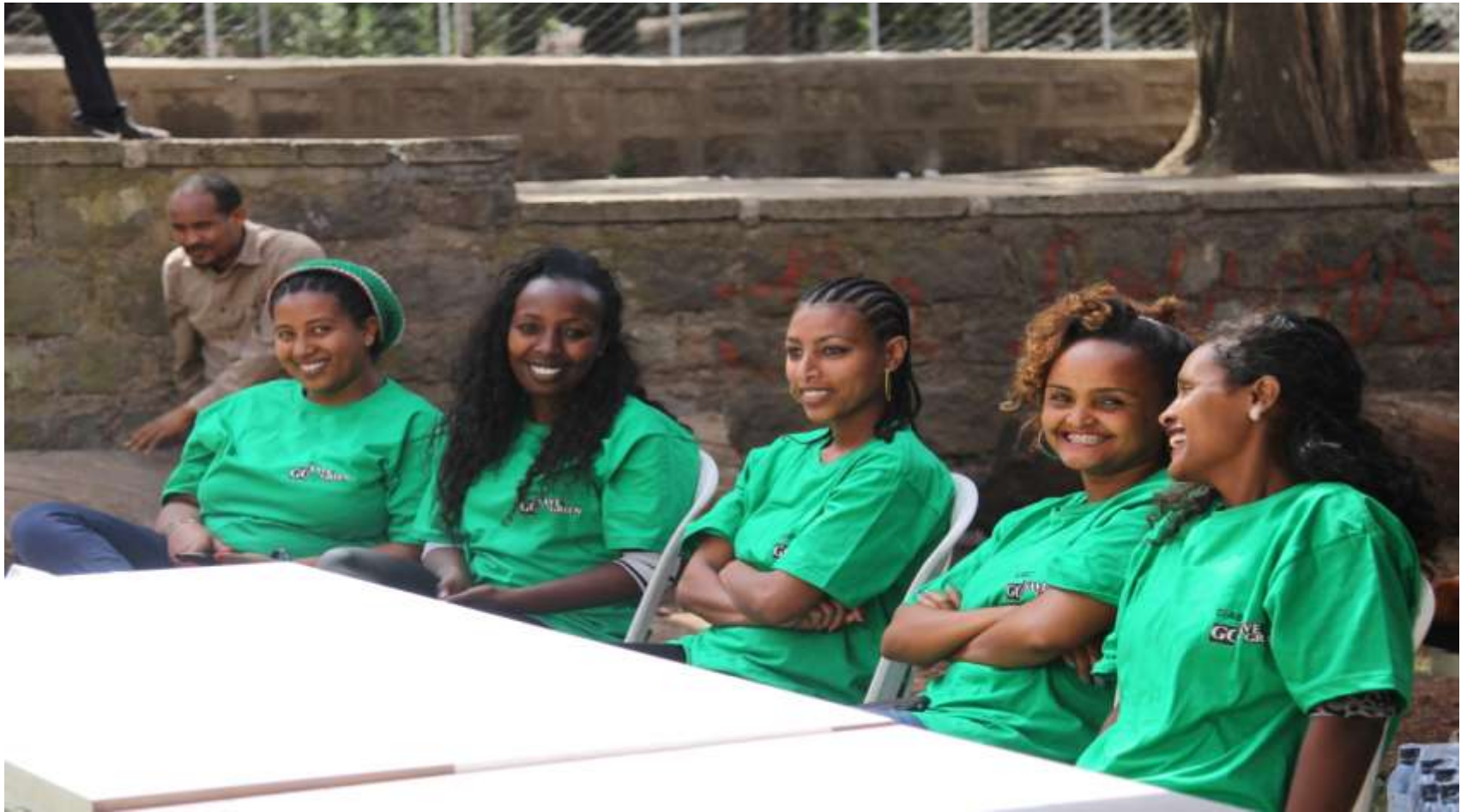
EiABC members of staff branded for Environment day