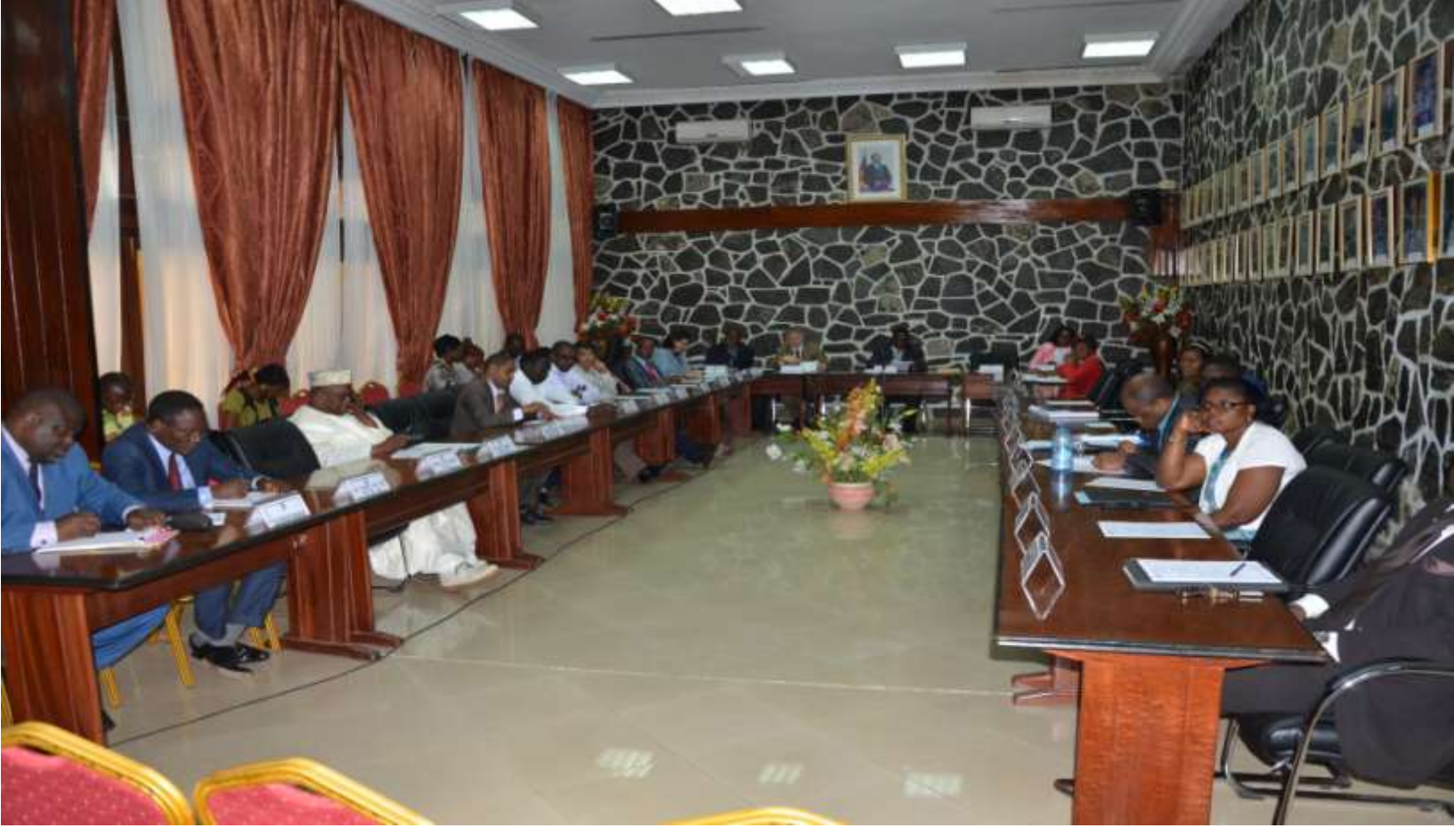
Cameroon, Yaounde- meeting president of Yaounde I