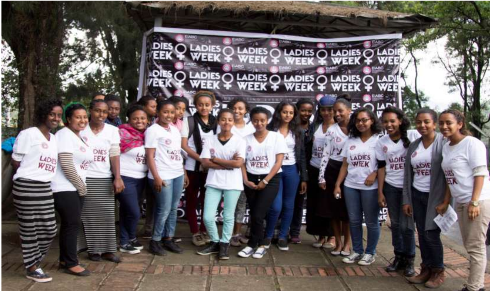
Members of newly launched EiABC ladies Club