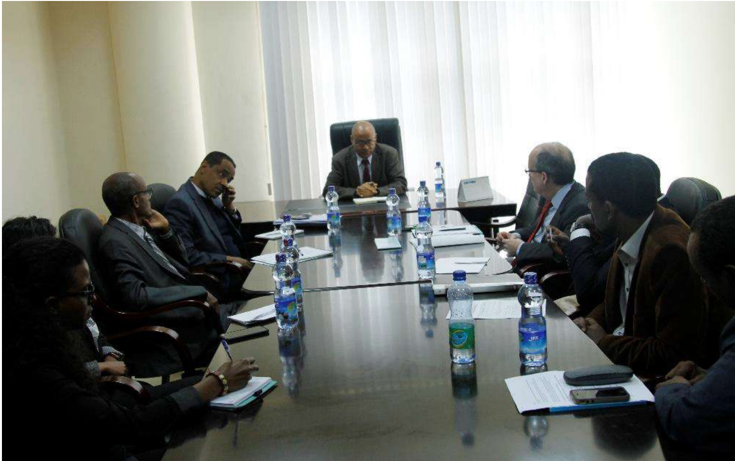
Meeting with EU Representative for Intra –ACP and Intar Africa project